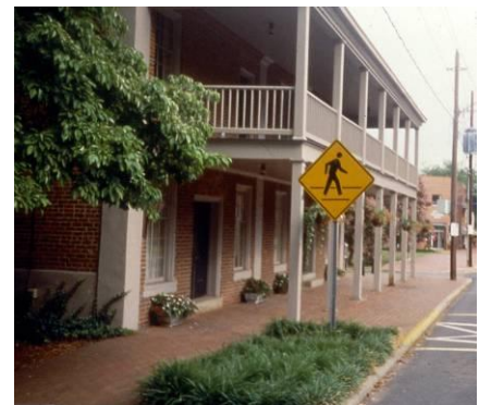
Example of a building with an arcade