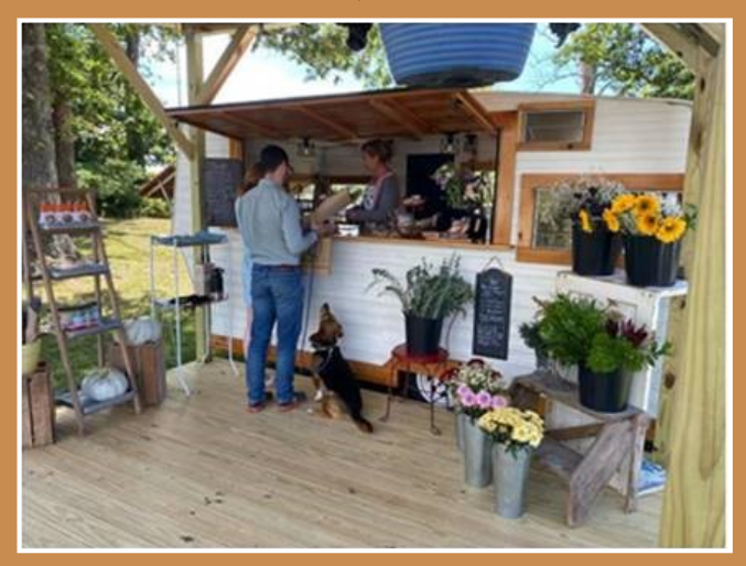
Follow "birdyandbark" on Facebook and Instagram