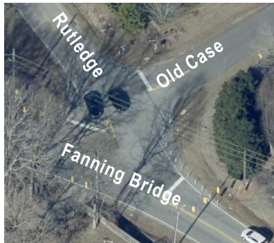
Pic # 1

According to witnesses, there seems to be two main reasons for these near accidents: (1) Rutledge Road drivers are looking at the wrong stoplight when approaching the intersection. You basically cannot see the stoplight for Rutledge Road until you are nearing the intersection (see pictures below). Rutledge Road drivers mistakenly assume the Fanning Bridge stoplight is theirs simply because they see it first. (2) Drivers turning "right on red" off Fanning Bridge Road fail to come to a complete stop before turning right. This is causing near misses for vehicles pulling out of Old Case Road. So please DRIVE DEFENSIVELY when are you in this area.