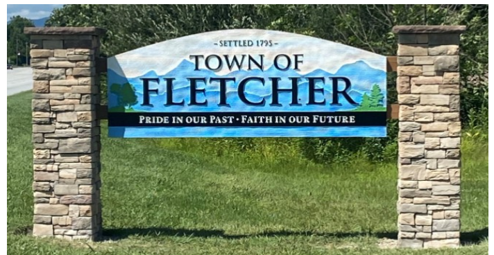
New Fletcher sign at the south end of town on Hendersonville Road

We celebrate the Declaration of Independence on July 4th for two reasons: (1) It represents an official severing of ties between the original 13 colonies and the rule of Great Britain; (2) It represents the core of our beliefs, the very makeup of our identity as citizens of the USA (borrowed from Military.com).