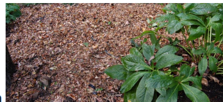
Leaf mulch being used in a flower bed

Finely chopped leaves make for an excellent lawn fertilizer. Mulch leaves by running over them with your mower during the next cutting, and leave the remains on the lawn. You can also spread the mulch across flower and vegetable beds.