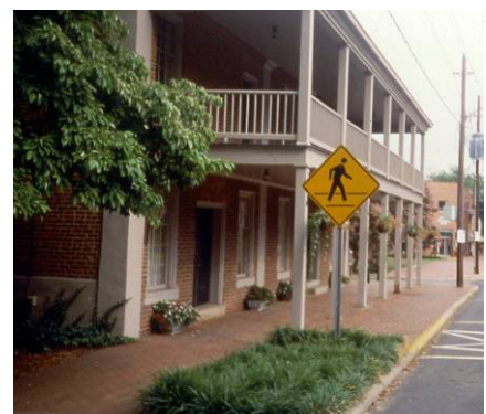
Example of a building with an arcade