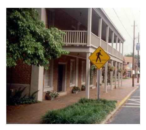
Example of a building with an arcade