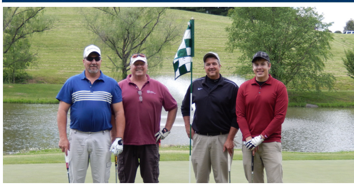
Friday, May 27th