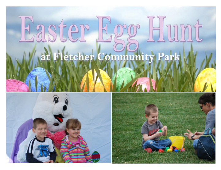
Thank you Egg Hunt Sponsors!

This event is sponsored by Park Ridge Health, Fleet Feet Sports, Morris Broadband, Pepsi Cola, and Mission Health.