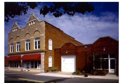
Residential over Residential/Office/ Retail

c. Ventilation grates or emergency exit doors located at the first floor level in the building facade, which are oriented to any public street, shall be decorative.