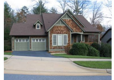
Single-Family Homes with Driveway