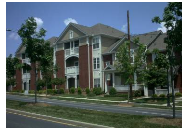
Multi-Family Apartments with Alley

2. Porches and Stoops: Useable porches and stoops should form a predominate motif of the building design and be located on the front and/or side of the building. Useable front porches are at least 8 feet deep and extend more than 30% of the facade.