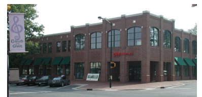
Residential/Office over Retail

2. Street Walls: The first floors of all mixed-use buildings shall be designed to encourage and complement pedestrian-style interest and activity by incorporating the following elements: