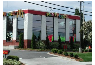
Fast Food Restaurant

2. Entrances: Buildings adjoining the US 25 right-of-way or intersections shall be designed so that the building addresses those spaces. Buildings must have a minimum of one primary entrance opening directly toward the street and connect to the public sidewalk either directly or by a walkway or other facility such as an arcade, patio, or stairs and ramp that accommodates pedestrians and wheelchairs.