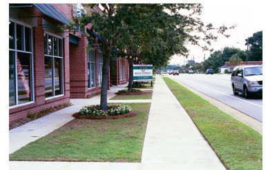
Retail along a thoroughfare

a. The first floor of all buildings fronting directly on a street shall include transparent windows and doors arranged so that the uses inside are visible from and/or accessible to the street on at least 50% of the length of the first floor building elevation along the first floor street frontage.