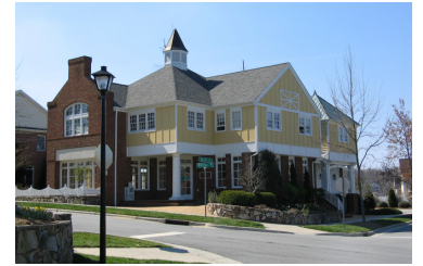
Office over Retail/Restaurant

A. Description: A multi-story small scale structure which can accommodate a variety of uses. A group of mixed-use buildings can be combined to form a mixed-use neighborhood center. Individual mixed-use buildings can be used to provide some commercial service, such as a neighborhood store, in close proximity to homes. The uses permitted within the building are determined by the District in which it is located.