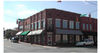
Office over Retail/Office

1. Building Orientation: Building facades in locations facing public streets, intersections, parks, squares, and other significant spaces shall be designed so that the buildings formally address such spaces. Entrances and window patterns shall face the appropriate adjacent public space.