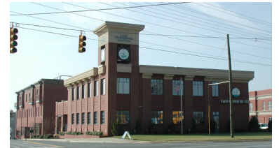
Office over Office/ Retail

a. The first floor of all buildings fronting directly on a street shall include transparent windows and doors arranged so that the uses inside are visible from and/or accessible to the street on at least 60% of the length of the first floor building elevation along the first floor street frontage.