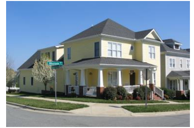
Single-Family Home with Alley

A. Description: The House is the predominant building type in the Town of Fletcher. It is flexible in use (where permitted), accommodating single family uses, multi-family uses up to four units, home occupations, professional offices, and limited retail uses based on the District in which it is located. The Town of Fletcher encourages the application of the following design guidelines in the development of such uses in residential areas.