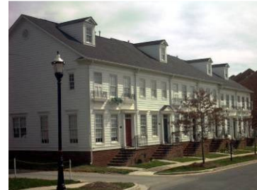
Multi-Family Townhomes with Alley

1. Bulk and Scale: The bulk and scale of multi-family infill development shall be similar to and consistent with the surrounding neighborhood as evaluated by the bulk of buildings adjacent, abutting and surrounding the proposed development. All buildings should be designed to adhere to the existing architectural pattern of the surrounding neighborhood.