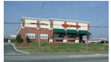
Pharmacy with Drive Thru

c. Ventilation grates or emergency exit doors located at the first floor level in the building facade, which are oriented to any public street, shall be decorative.